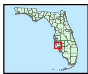
Sarasota County, Florida For Reference Only