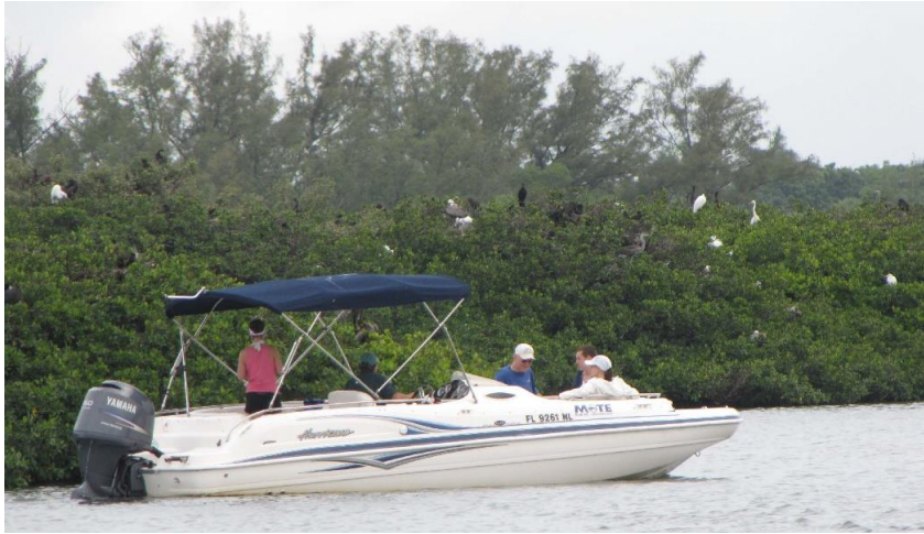
Boaters travelling closely to the mainland side of the Roberts Bird Colony Islands, June 8, 2009. Note the zone of “no nesting”.