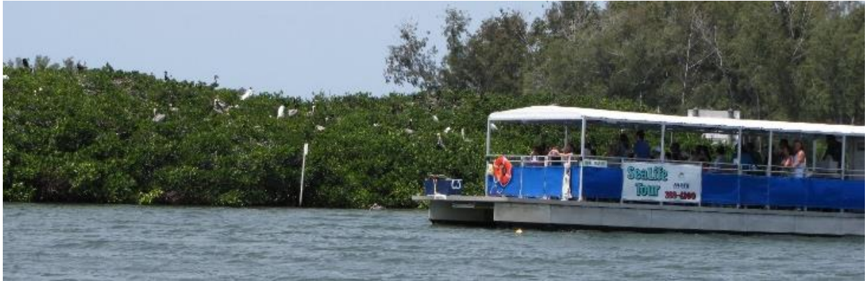
Ecotour boat, and zone of “no nesting” on the mainland side of the island, May 24, 2015.