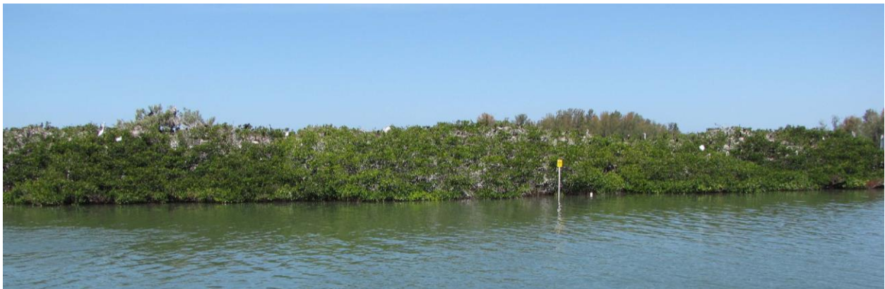
The mainland side of the Roberts Bay Bird Colony Islands shows a distinct “no-nesting” zone, May 24, 2015.