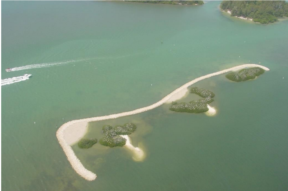
Top: Jan 2008 aerial depicting the newly installed breakwater, proximity to the Intracoastal Waterway, and nesting by Great Egrets and Brown Pelicans.