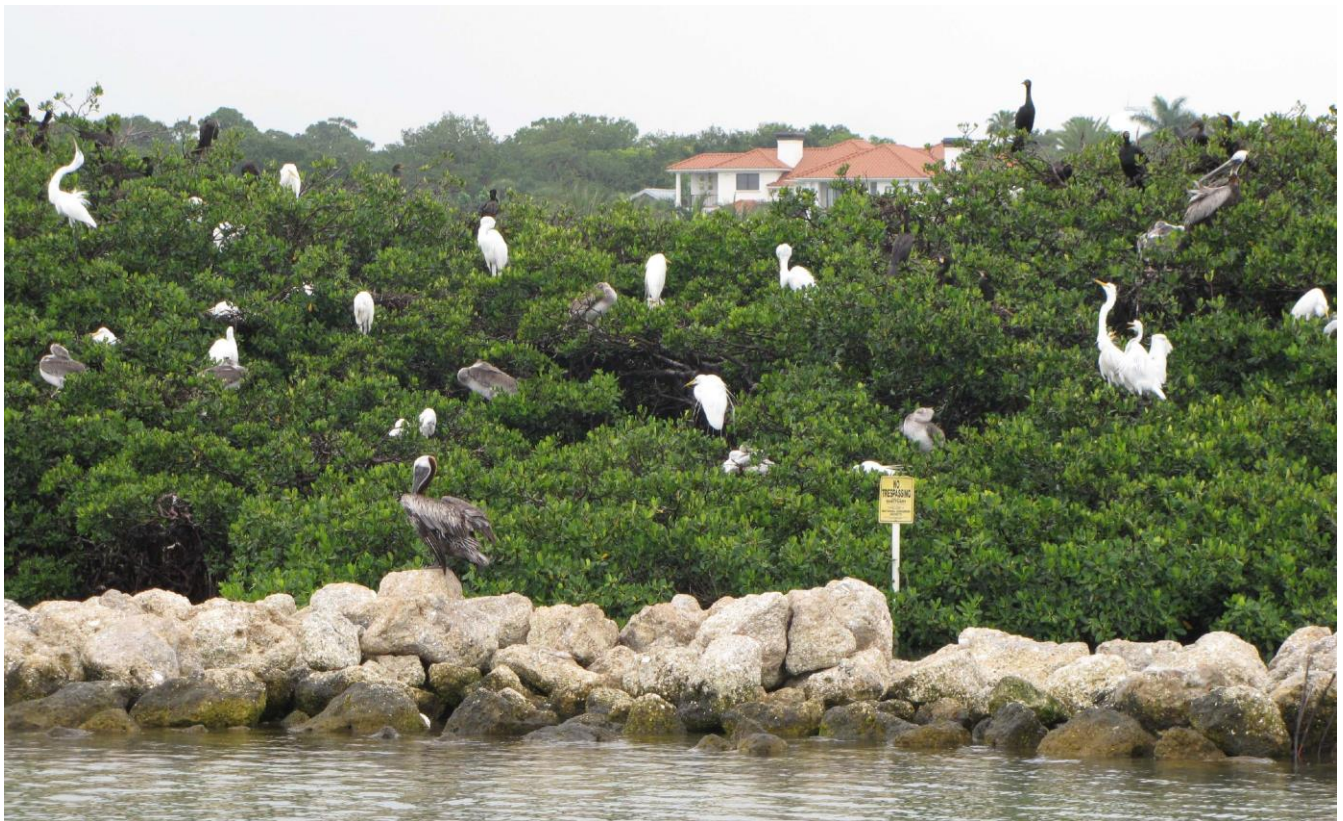
Courting Great Egrets and other nesting birds using the entire mangrove habitat on the breakwater side of this Roberts Bay Bird Colony island, June 8, 2009.