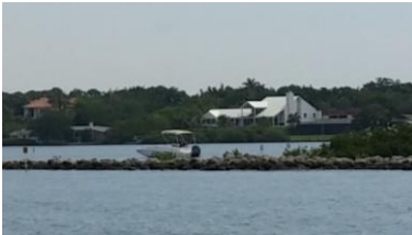
A boat approaches closely to the south (left) and middle (right) islands at the Roberts Bay Bird Colony, May 16, 2016.