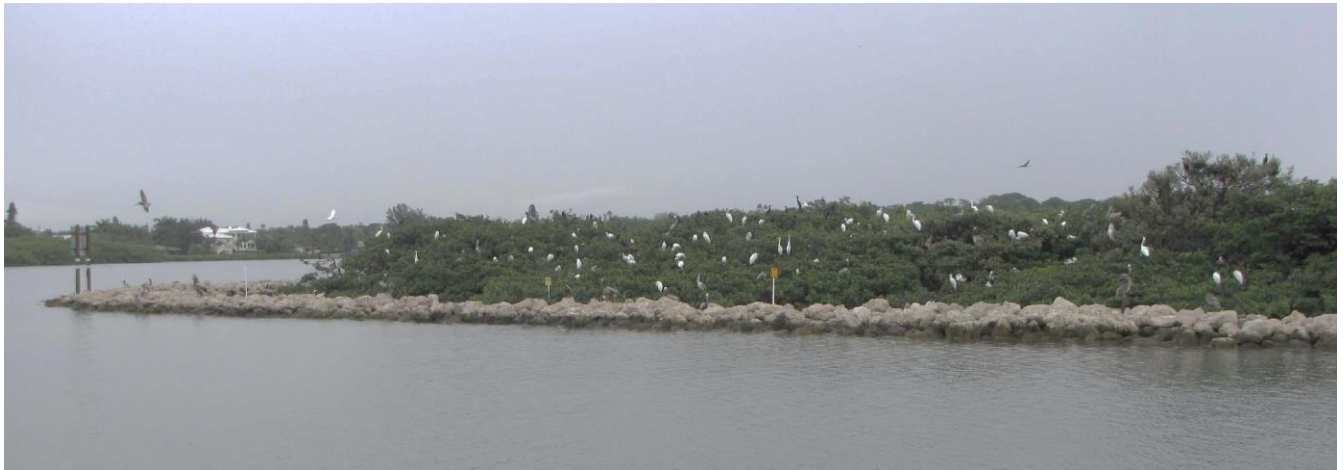
The breakwater and the north island of the Roberts Bay Bird Colony Islands, June 8, 2009. Note: nesting activity occurs down the entire slope of the mangroves to the water line.