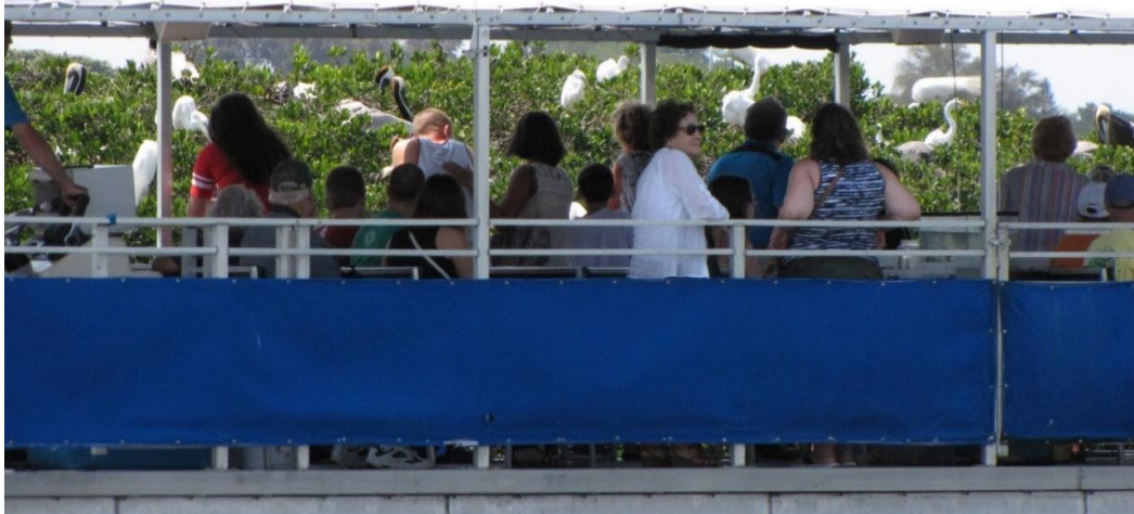
Ecotour boat close to the Roberts Bay Bird Colony Islands, May 24, 2015.