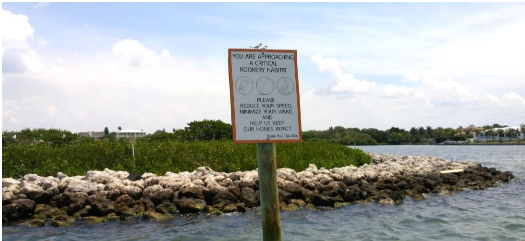
Informational sign installed by Sarasota County.