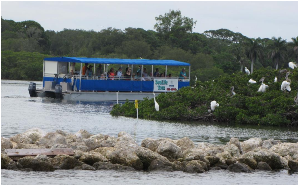
Ecotour boat on the mainland side of the Roberts Bay Bird Colony's north-most island, June 8, 2009. Note: the birds are nesting all the way to the waterline on the island side facing the breakwater, which has little boat traffic.