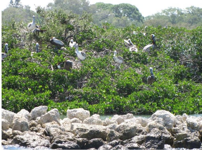
Brown Pelican adults and chicks in their nests, protected from boaters by the breakwater, use the entire slope of the mangrove habitat available, June 8, 2009.