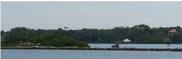
A jet skier approaches very close to the middle island at the Roberts Bay Bird Colony, May 16, 2016.