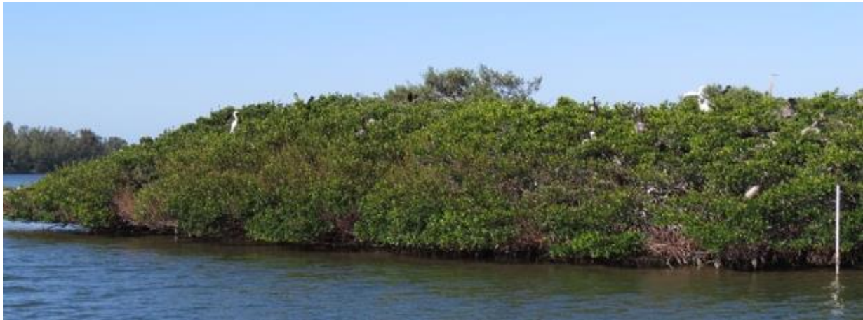
Mainland side of Roberts Bay Bird Colony north island, showing the “no-nesting” zone, April 5, 2016.