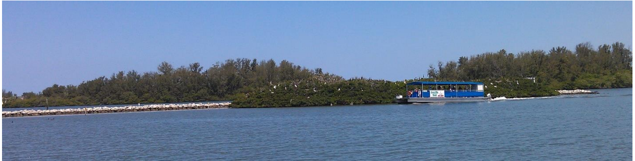
Below: Ecotour boat travelling fast enough to produce a wake, coming, along the length of the Roberts Bay Bird Colony Islands, and going, 6-12-2012.