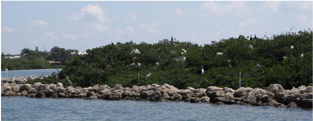
Birds nesting on the breakwater side of the Roberts Bay Bird Colony, using the entire mangrove habitat available, down to the waterline, June 24, 2015.