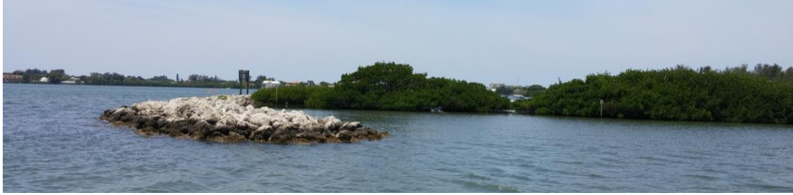
Roberts Bay south island, showing the “no nesting zone” on landward side, May 16, 2016.