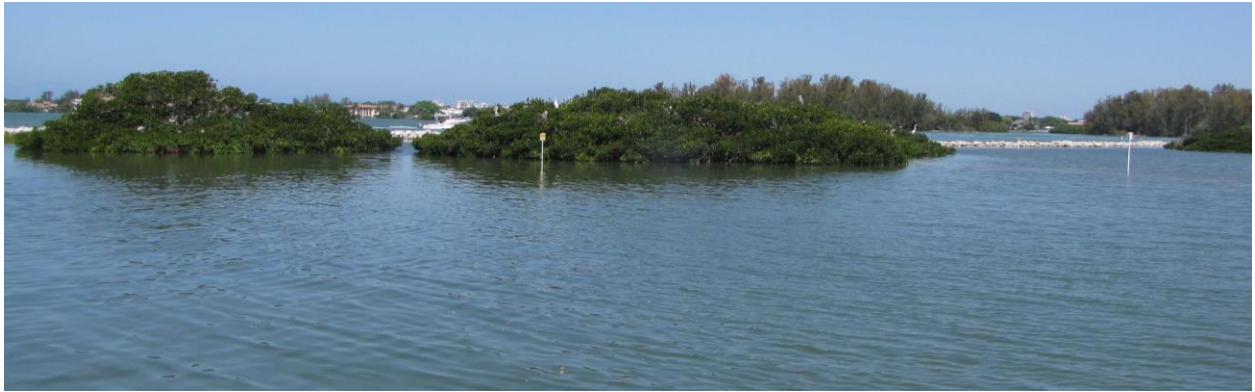
Mainland side of the Roberts Bay Bird Colony islands, showing the “no-nesting” zone, May 24, 2014.