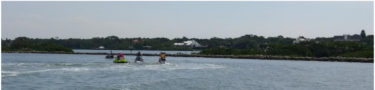
Jet skiers approaching the Roberts Bay Bird Colony islands, May 16, 2016.