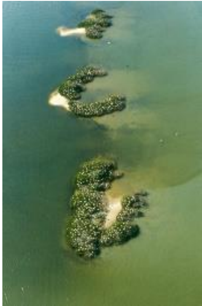
Aerial photograph of the Roberts Bay Bird Islands taken in 1995, from the north, showing the use of the island by nesting birds.

The breakwater located between the Intracoastal Waterway and the Roberts Bay Bird Colony Islands was installed to protect the islands by Sarasota County using Pollution Recovery Funds at an expense of approximately $900,000 in the fall and winter of 2007-2008. Years of observations had made it clear that boat wakes were eroding the islands, reducing the mangrove bird nesting habitat. This habitat protection project was undertaken by the County in response to appeals from Audubon Florida, Sarasota Audubon Society, and other members of the public.