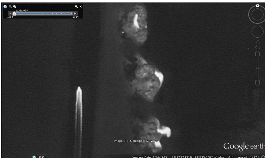
U.S. Geological Survey aerial of the Roberts Bay Bird Colony Islands, January 26, 1995, showing proximity to the Intracoastal Waterway, before the installation of the breakwater that protects the islands from erosion.