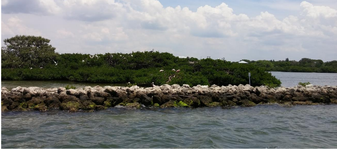
Above and below: Roberts Bay Bird Colony Islands, with young-of-the-year spoonbills and pelicans on breakwater, May 16, 2016.