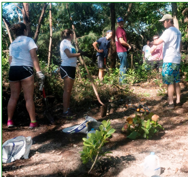
Planting in the Cleared Spaces.