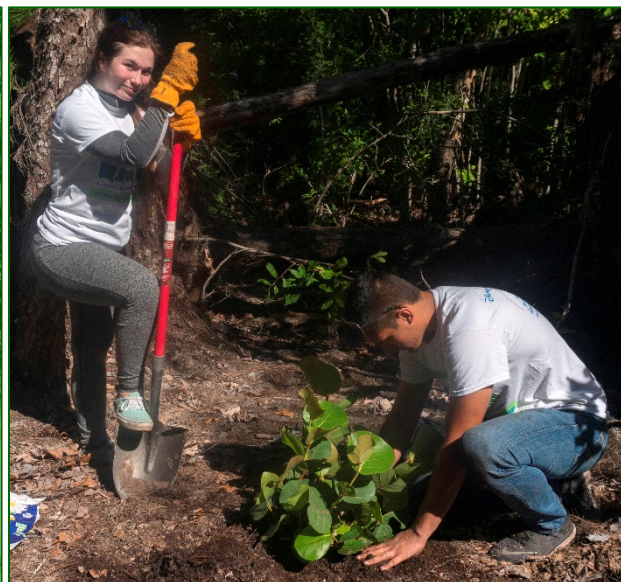
Sea Grapes Going In.