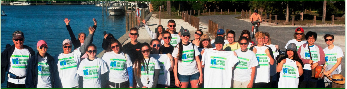
Getting ready to head out.

Traditional rivals Sarasota and Riverview High Schools worked together on Saturday March 3, 2018 when they joined forces with Sarasota Bay Watch to make Skier's Island just a little bit better. Skiers Island is located in Roberts Bay in between Siesta Key and the mainland. Over the years it accumulated trash and became dominated by a non-native tree called carrotwood.