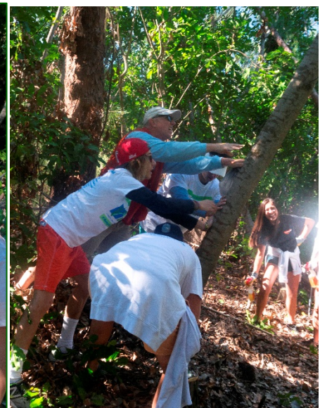
Another One Bites the Dust.