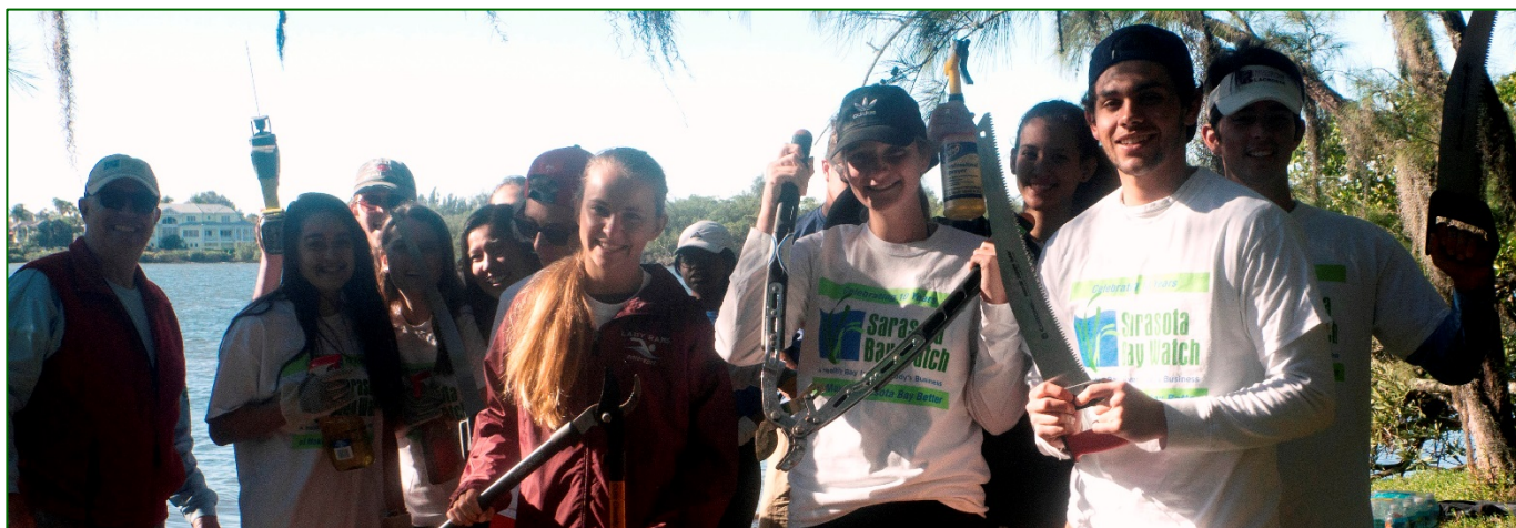
The Skiers Island Restoration Tribe.

It takes a real dedication to root out litter found on an island that is covered with dense vegetation. Trash floats onto the shores and gets tangled in the mangrove jungle. Volunteers had little "grabbers" to reach into these inaccessible areas. We found a lot of styrofoam (about 40 pounds!), lawn chairs, plywood, fishing line, a butterfly net, a plastic owl and much more for a total of about 425 pounds of waste.