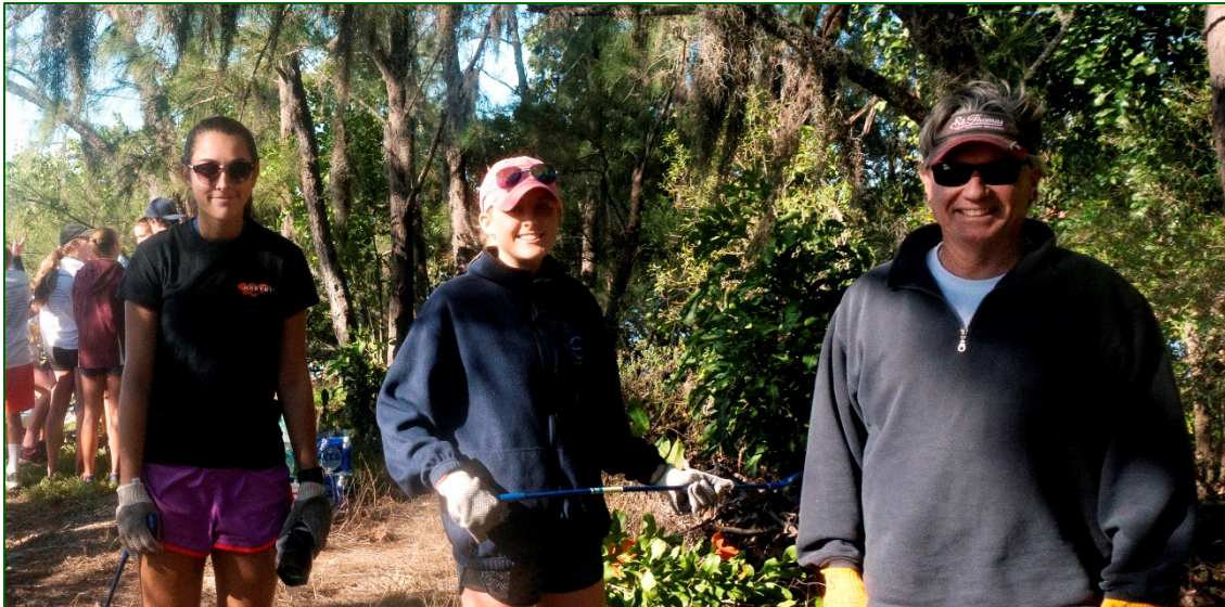
Nice Day with Good People.