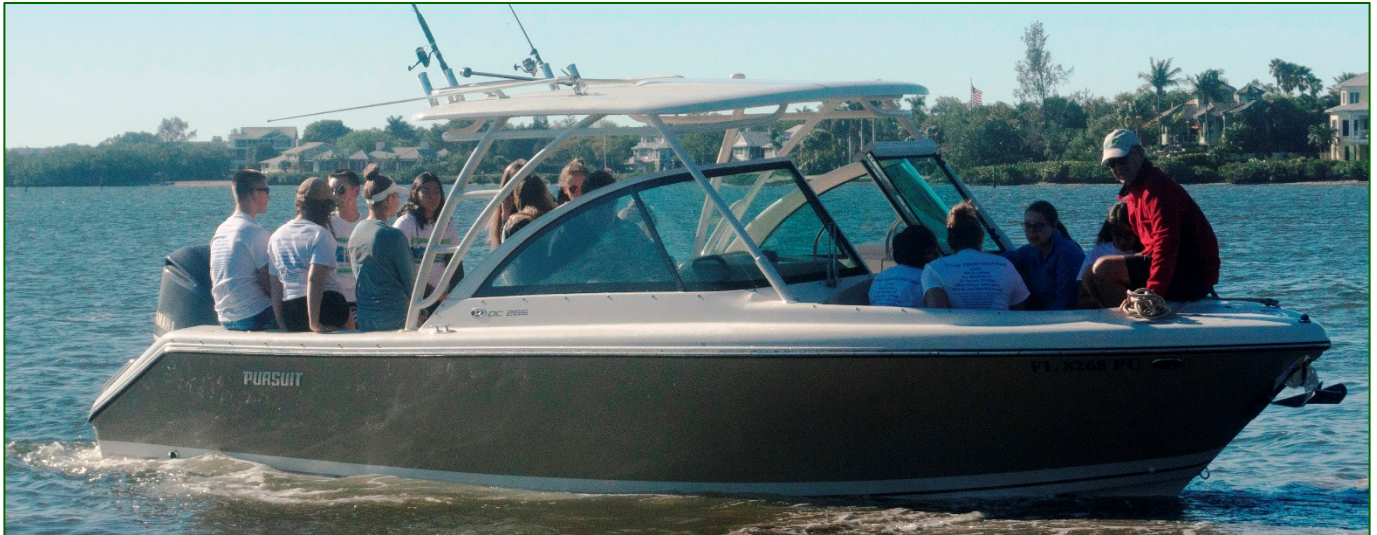
What a Gorgeous Day.