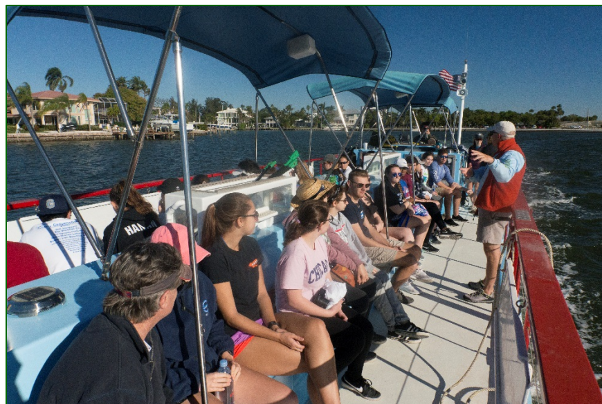
The Carefree Learner ferrying volunteers to Skiers Island.

A big group of 71 hardy souls took the SHS Carefree Learner and other boats from Patterson Park at Siesta Drive over to the island. They cleared out areas of pure carrotwood, piled up the brush, replanted with native species and removed a small mountain of trash.