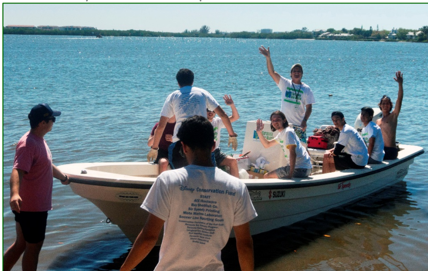
Friends Hauling Trash Back to Land.