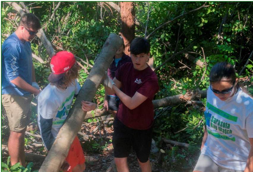
Working Hard to get the Job Done.

Thanks to Albritton's Nursery who provided the sea grape and pitch apple plants plus potting soil at cost. Let's not forget DG ACE Hardware who provided a whole variety of tools for the event too. Sarasota County Parks Department did a great job of providing valuable guidance about how to do this kind of work effectively. Thank you very much.