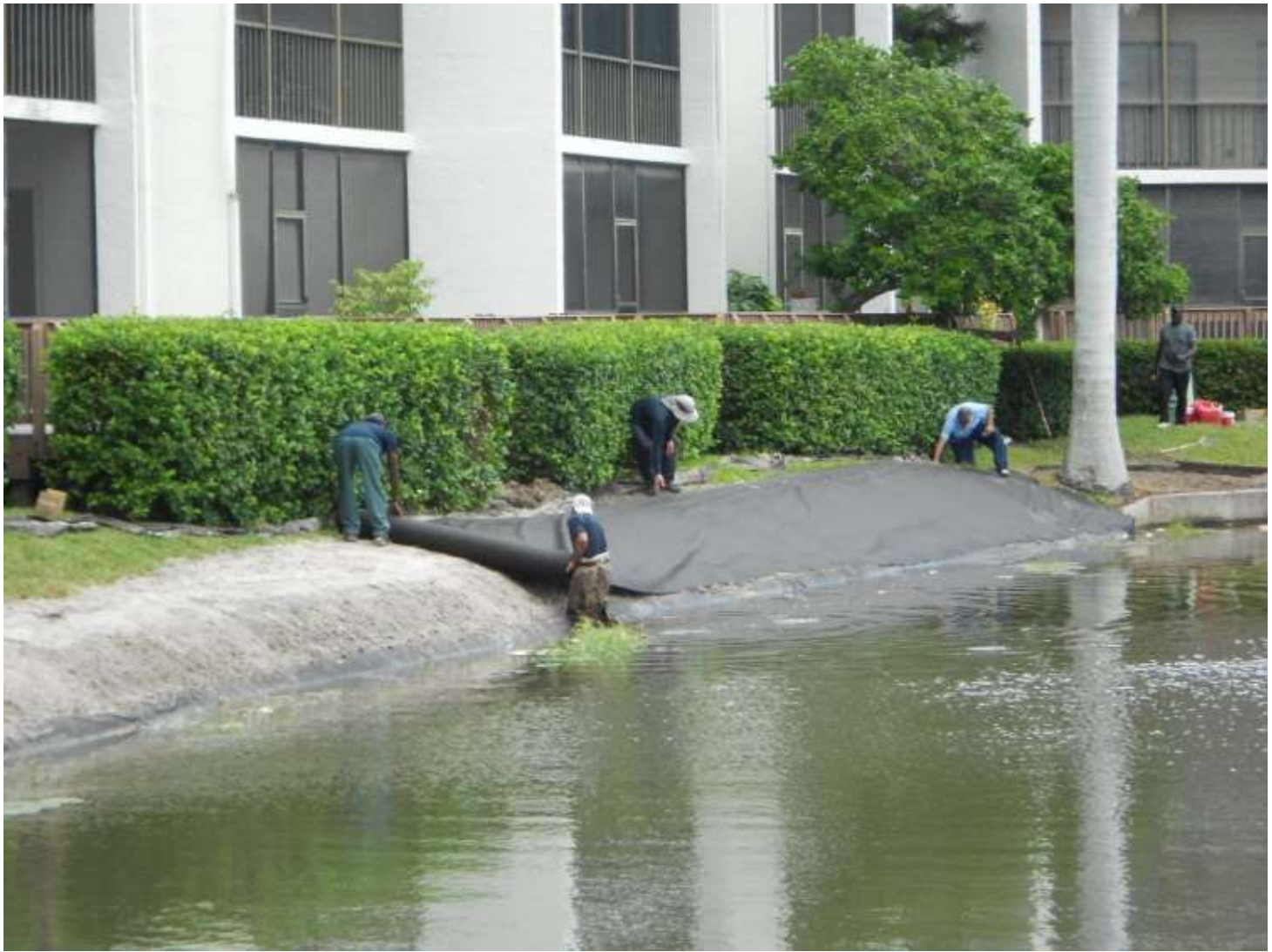
Covering of the Bank