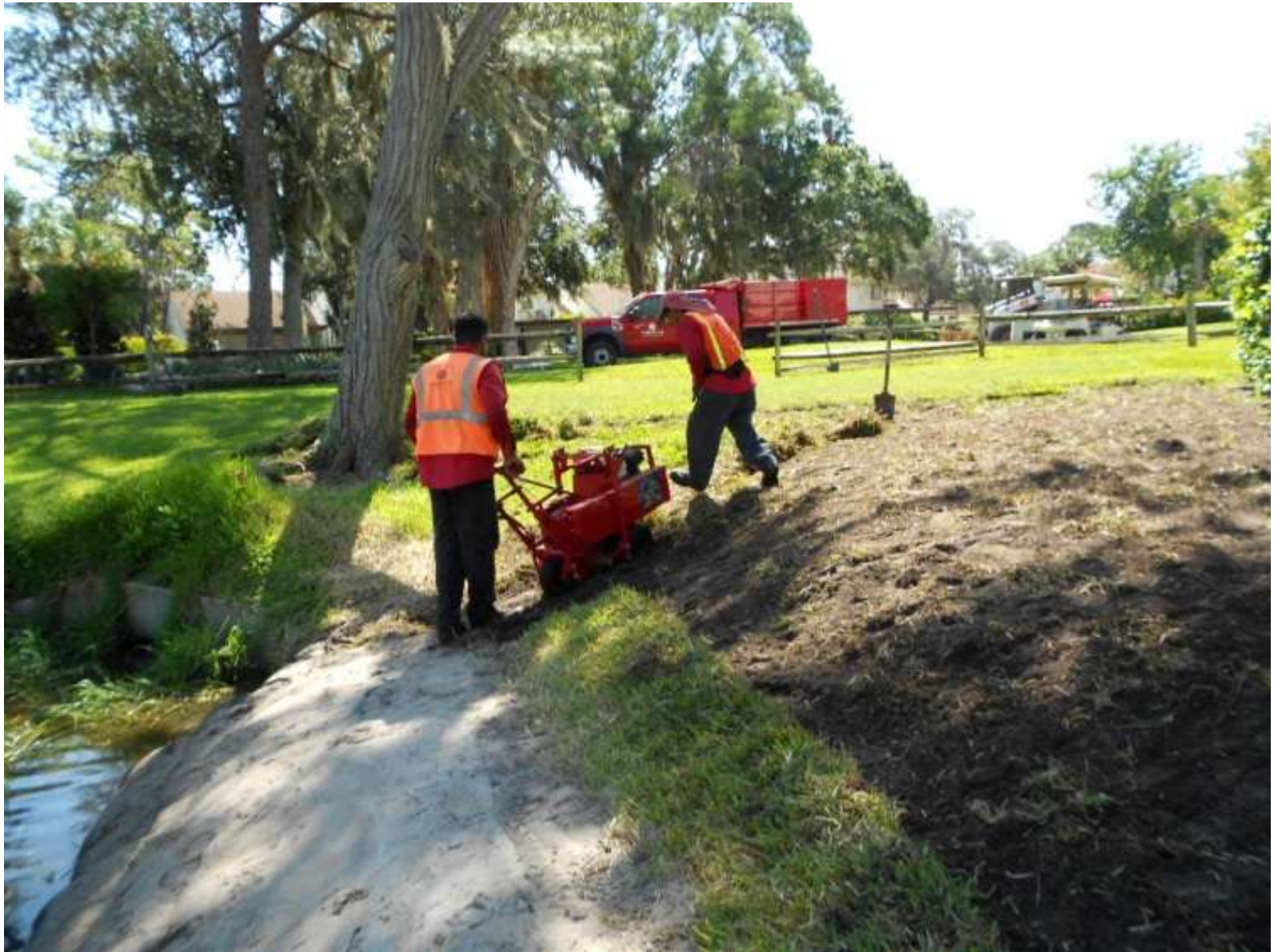
Removing existing sod around Pond