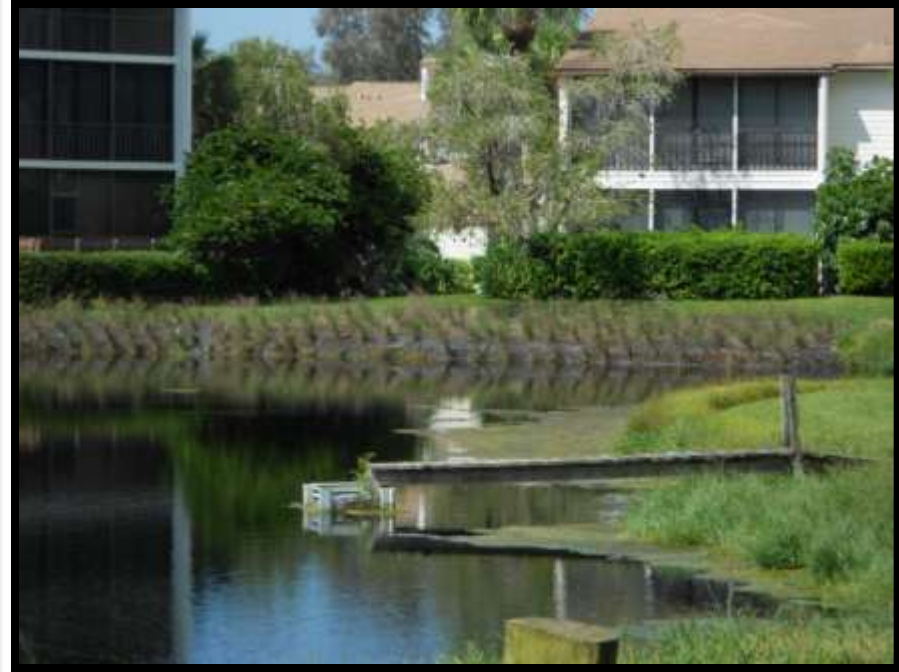
Swamp Ferns, Walter's Viburnum, and Lots of Muhly Grass.