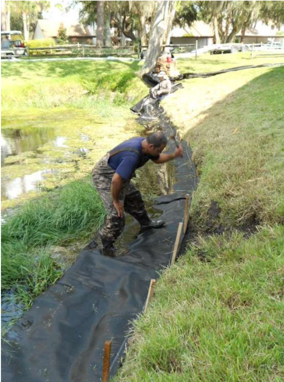
Stakes Installed to Attach the Tube to the Bank for Filling