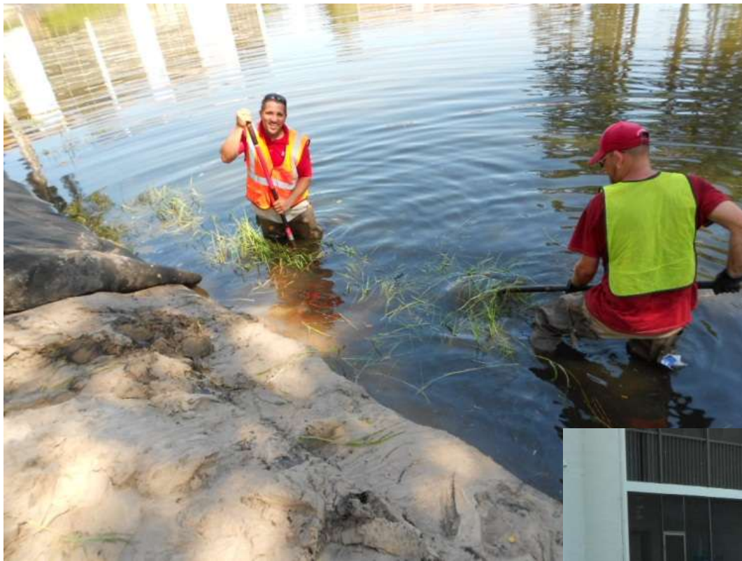
Repairing the damage Shoveling soil from pond to bank and wheel barrowing in soil.