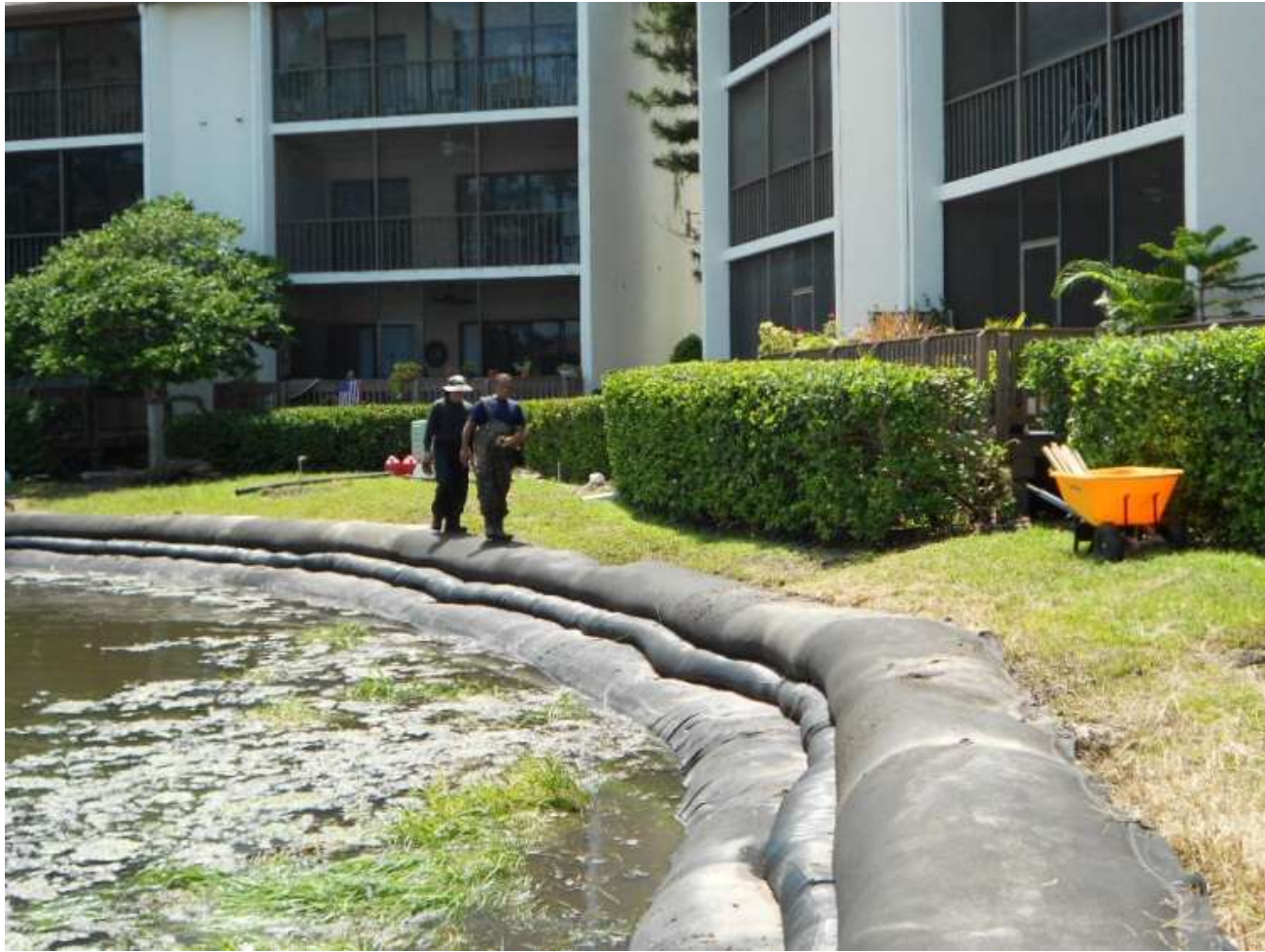
Three Tubes Bulging With Joy (Note How Firm the Tubes Are)