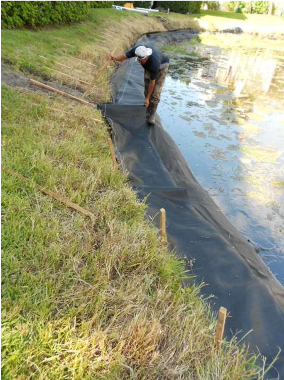
Second Tube is Rolled Out