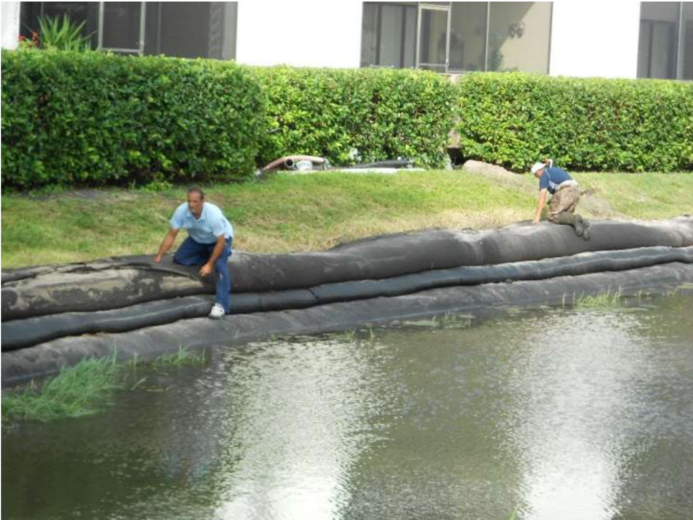
The Cutting of the Sacrificial Tube