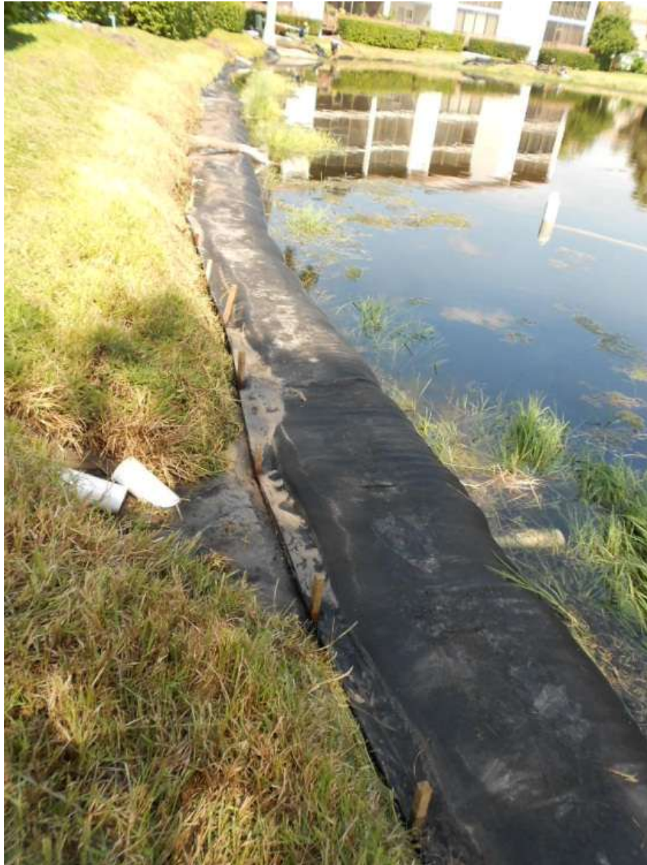
First Tube Fat and Sassy