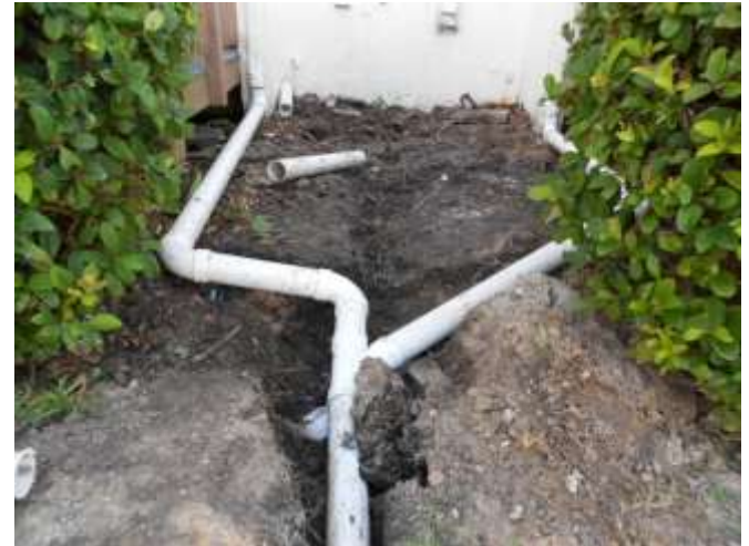
Down Spouts Extended Out and Under the First Tube