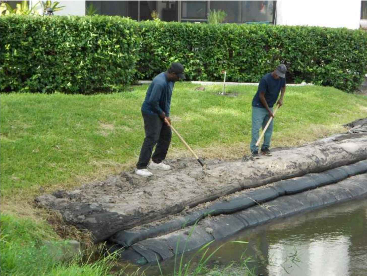
Using the Soil in the Sacrificial Tube, The Soil is Spread to Create a More Natural Slope