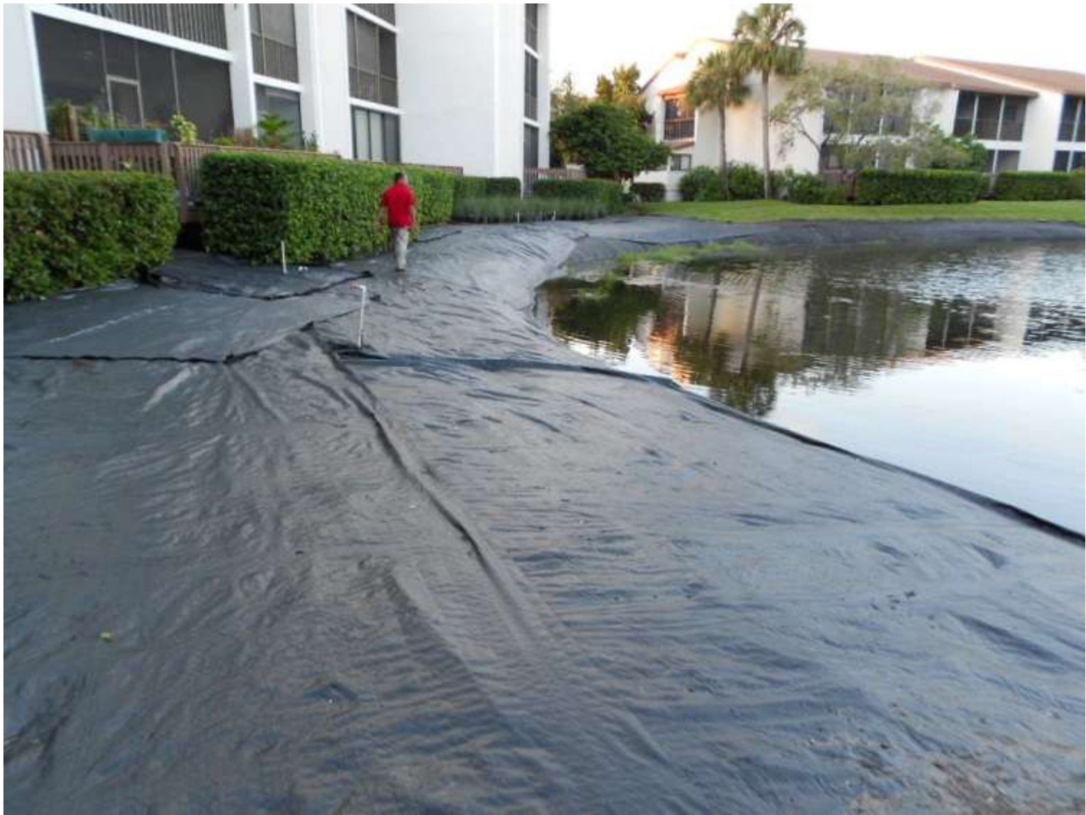
Protected and Ready for Plants