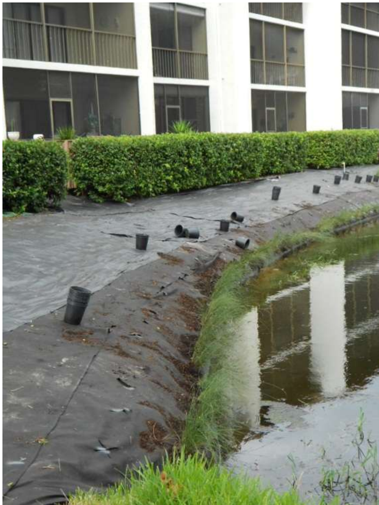
First Row Goes In