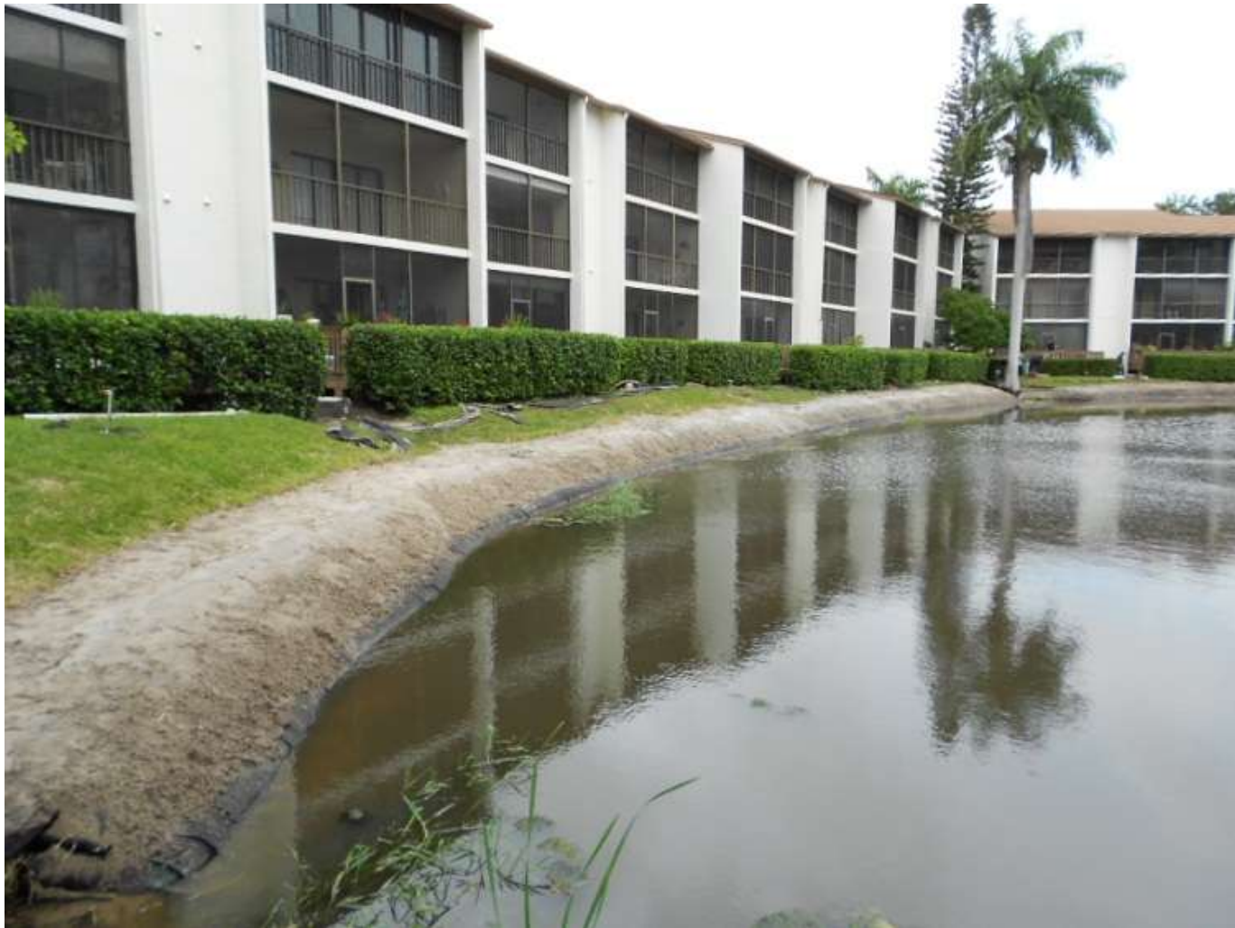
Spreading of the Soil Complete