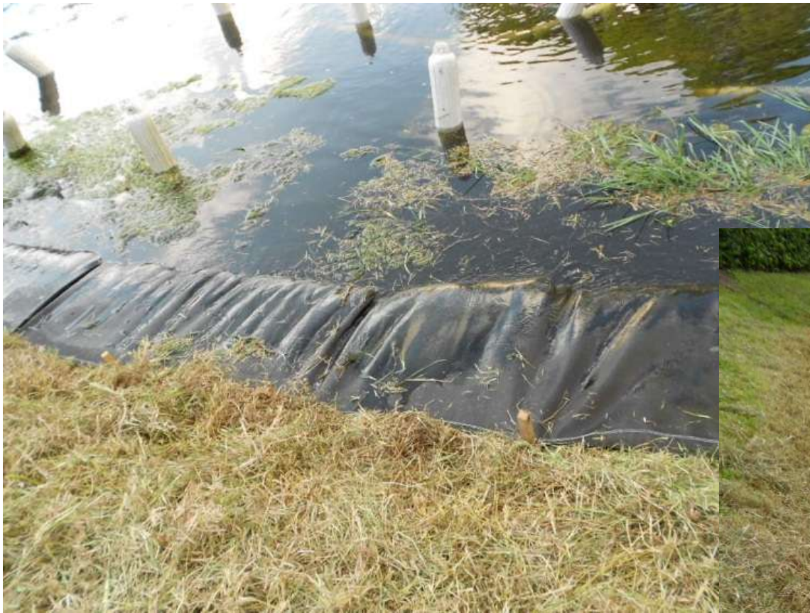
The Tube Begins to Take Shape