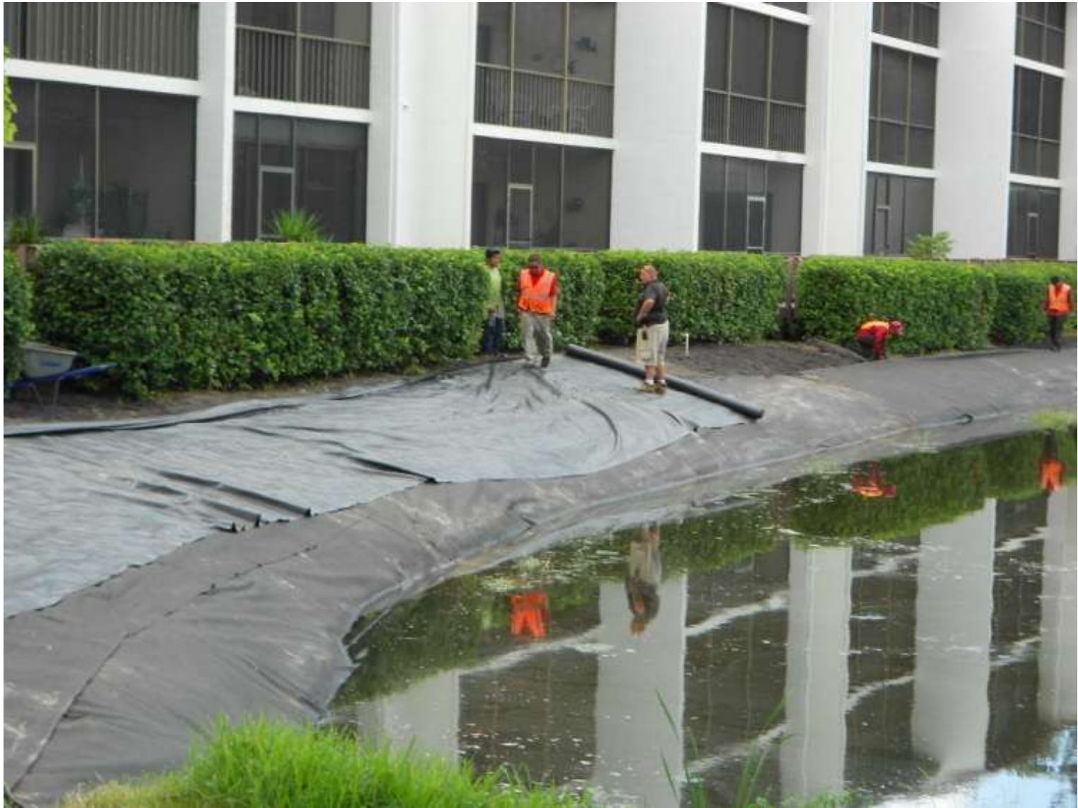
Re-installing the covering on the Geo-tubing and installing weed matting up to shrub line to limit erosion.